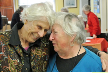
We are Neighbor to Neighbor!